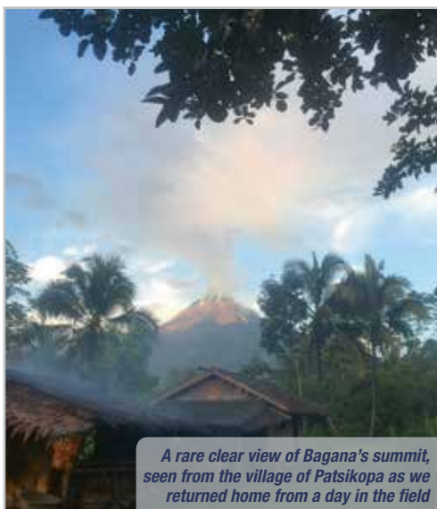
A rare clear view of Bagana's summit, seen from the village of Patsikopa as we returned home from a day in the field