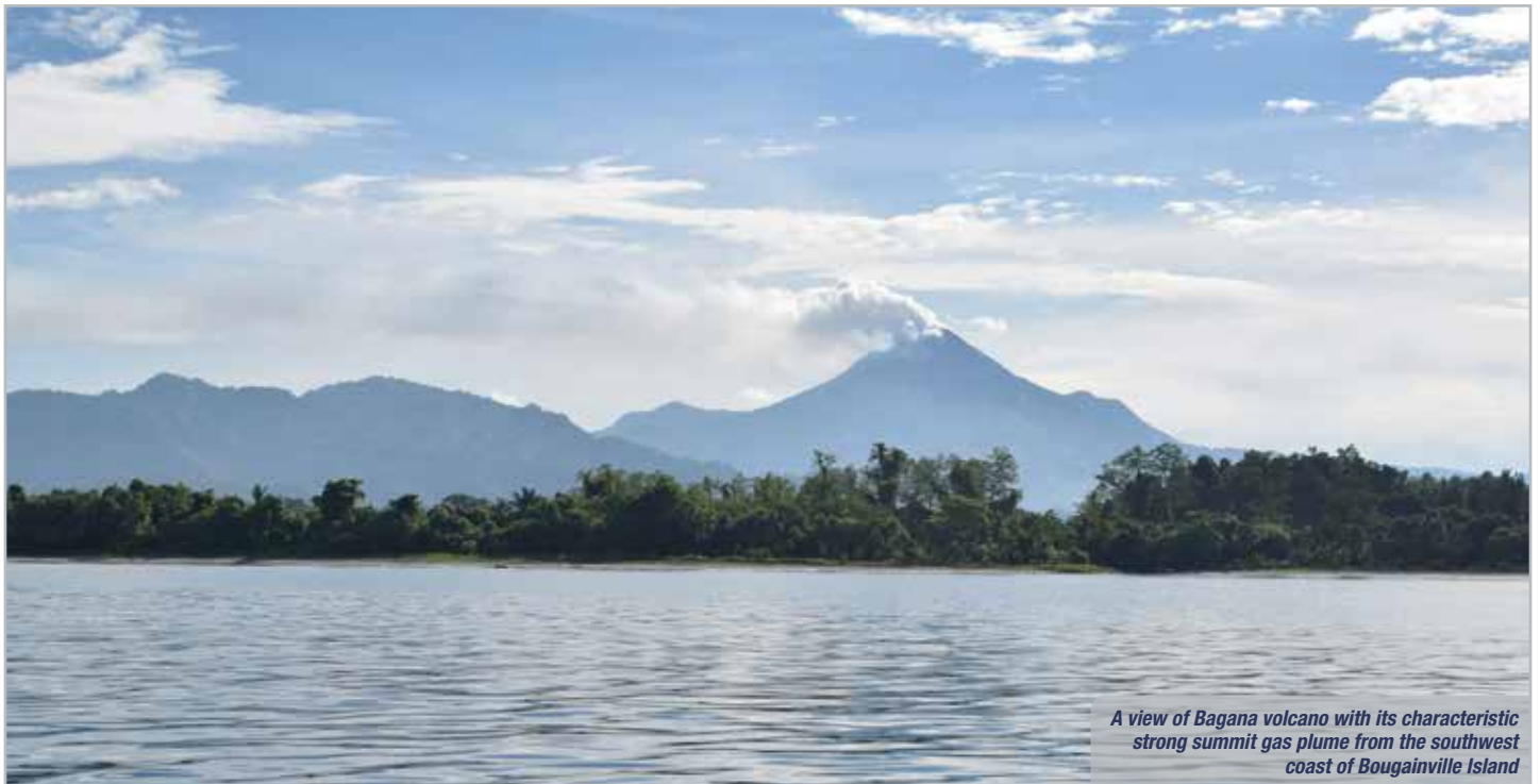
A view of Bagana volcano with its characteristic strong summit gas plume from the southwest coast of Bougainville Island