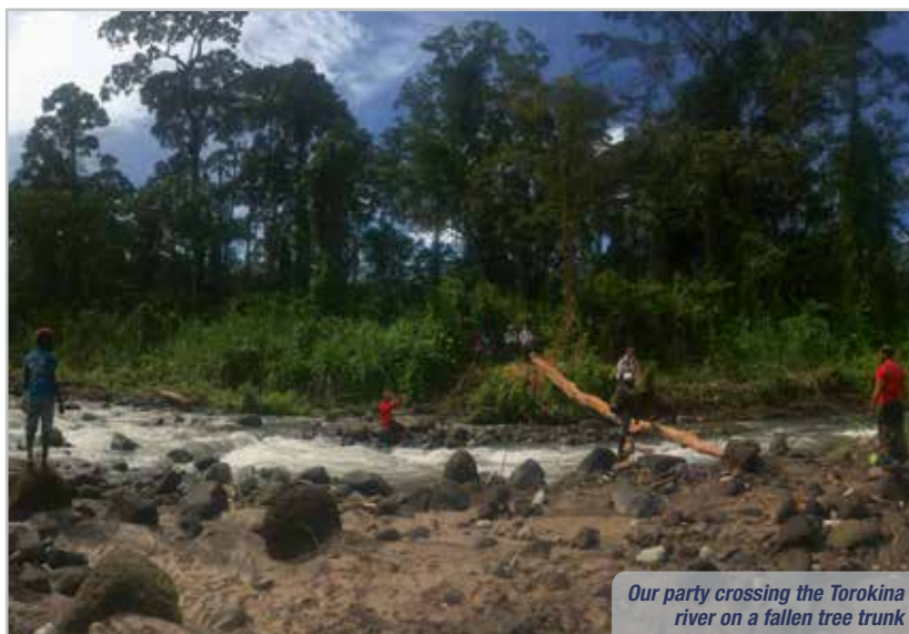
Our party crossing the Torokina river on a fallen tree trunk