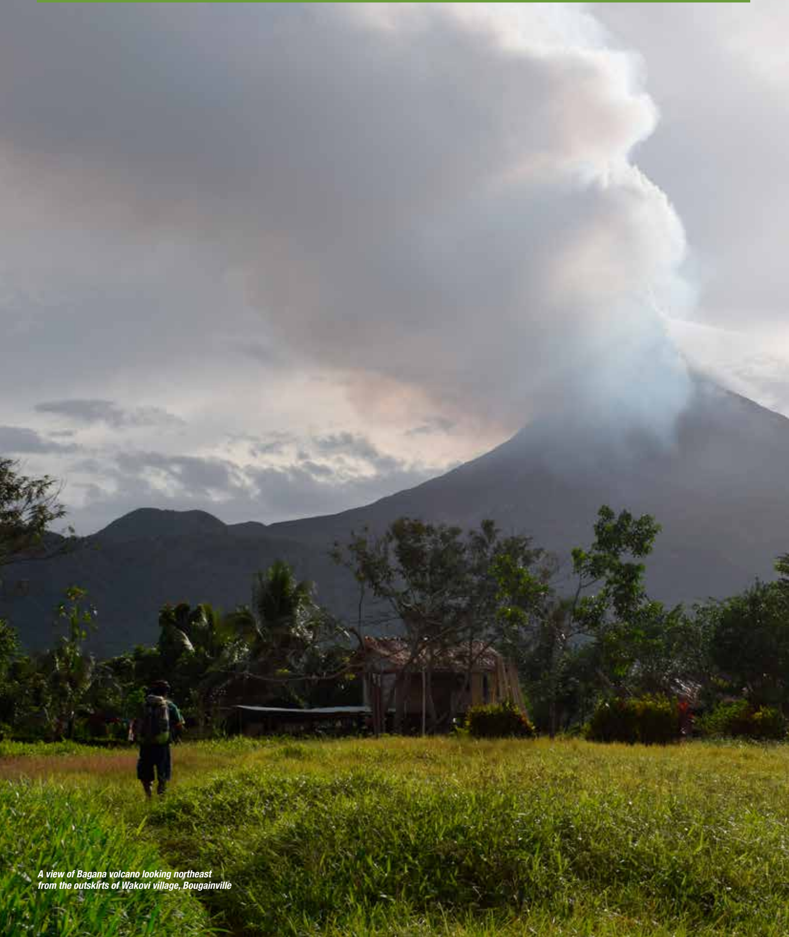
A view of Bagana volcano looking northeast from the outskirts of Wakovi village, Bougainville